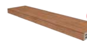
Gradone Lineare / LG 9 Grip 15x60 6"x24" 095