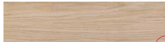
LG 5 Grip 15x60 6"x24" 079

In fase di posa si consiglia una sfalsatura massima di 15 cm Do not offset brick pattern by more than 15 cm Bei versetzter Verlegung wird ein Versatz von maximal 15 cm empfohlen En phase de pose on conseille un décalage de 15 cm au maximum