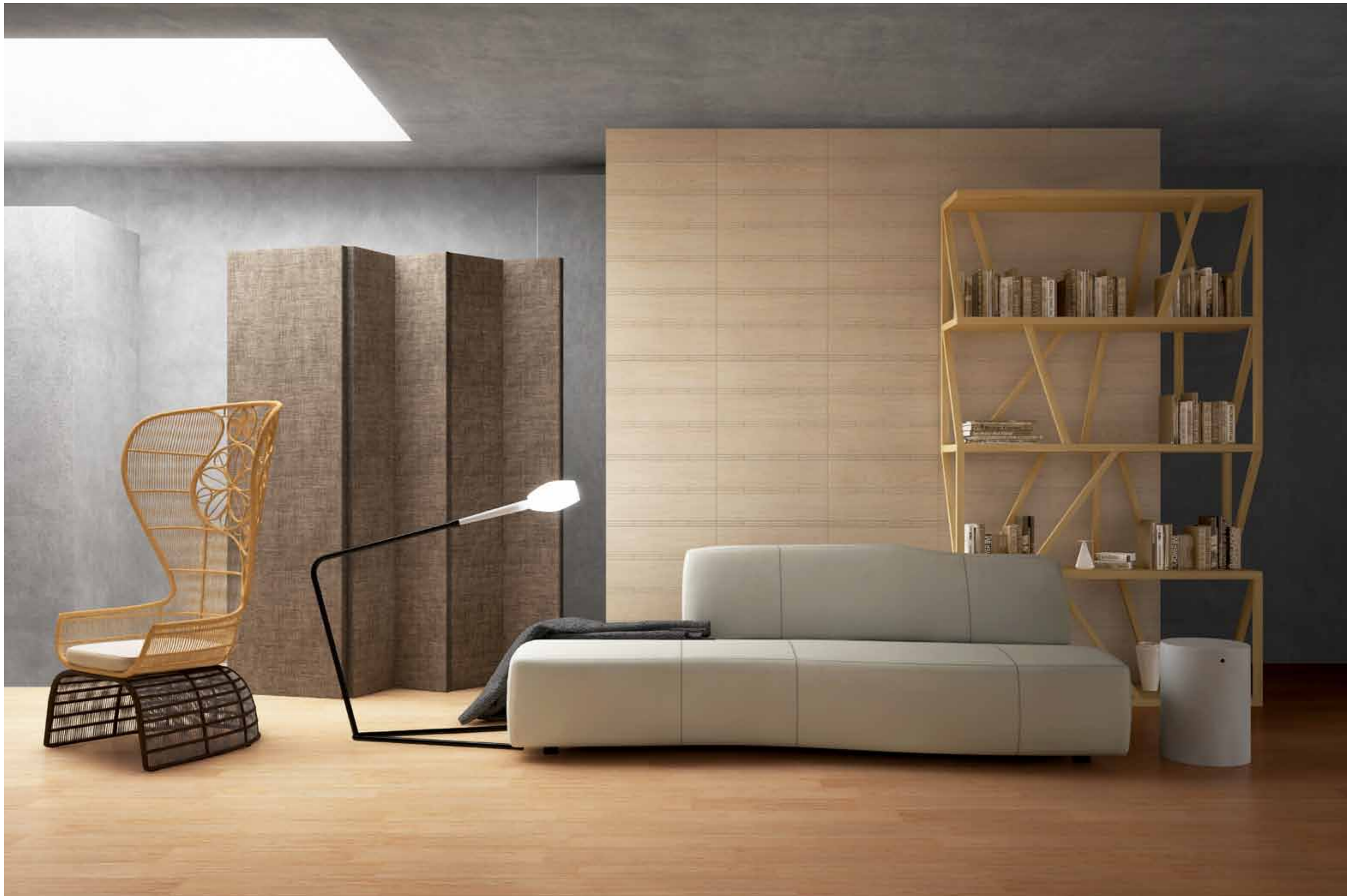
LF 1 - LF 10 - Mosaico / LF 10