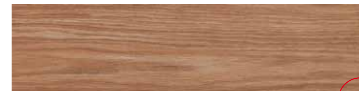
LG 9 Grip 15x60 6"x24" 079

In fase di posa si consiglia una sfalsatura massima di 15 cm Do not offset brick pattern by more than 15 cm Bei versetzter Verlegung wird ein Versatz von maximal 15 cm empfohlen En phase de pose on conseille un décalage de 15 cm au maximum