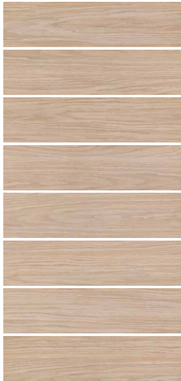
LF 5 15x60 6"x24" 073

In fase di posa si consiglia una sfalsatura massima di 15 cm Do not offset brick pattern by more than 15 cm Bei versetzter Verlegung wird ein Versatz von maximal 15 cm empfohlen En phase de pose on conseille un décalage de 15 cm au maximum