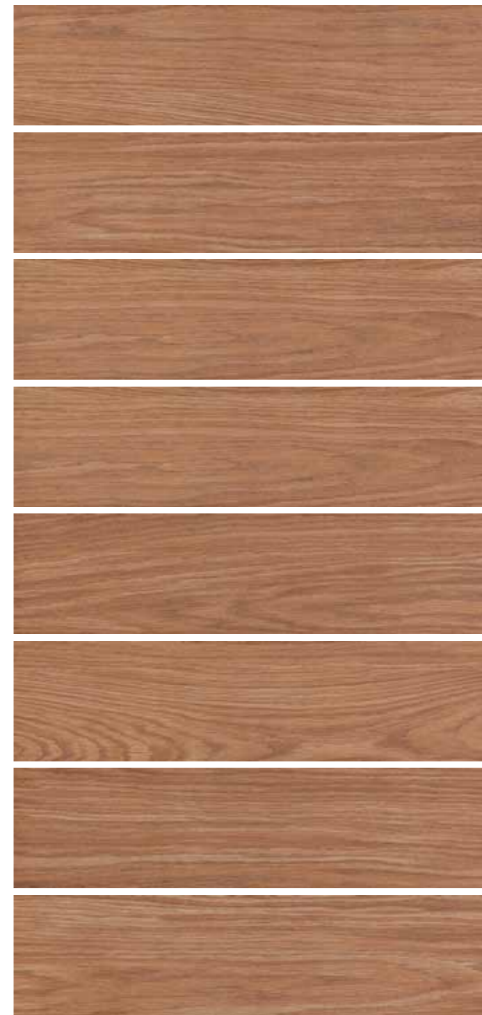
LF 9 15x60 6"x24" 073

In fase di posa si consiglia una sfalsatura massima di 15 cm Do not offset brick pattern by more than 15 cm Bei versetzter Verlegung wird ein Versatz von maximal 15 cm empfohlen En phase de pose on conseille un décalage de 15 cm au maximum