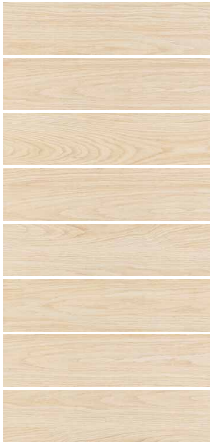
LF 10 15x60 6"x24" 073

In fase di posa si consiglia una sfalsatura massima di 15 cm Do not offset brick pattern by more than 15 cm Bei versetzter Verlegung wird ein Versatz von maximal 15 cm empfohlen En phase de pose on conseille un décalage de 15 cm au maximum