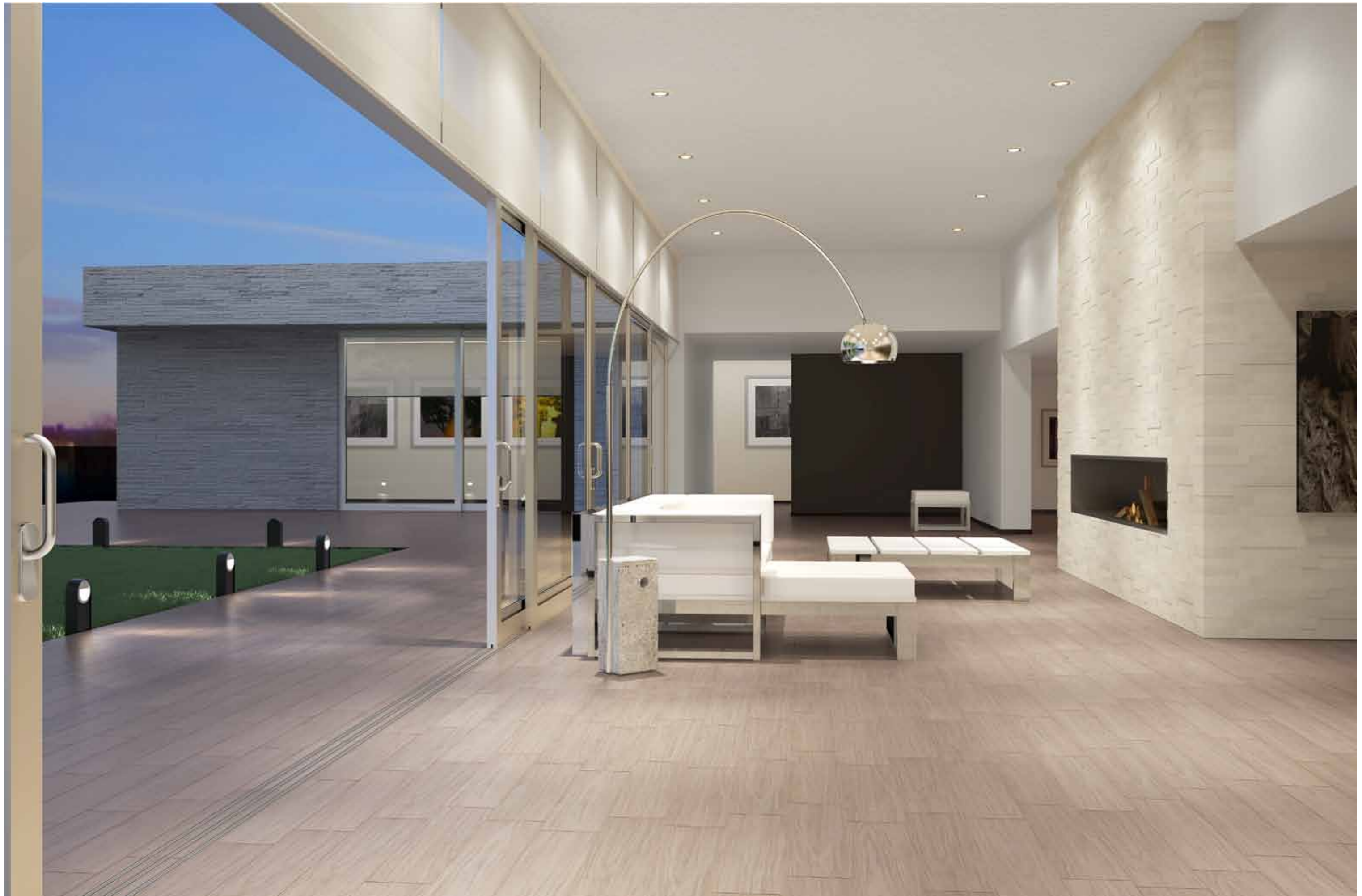
Outside: LG 5