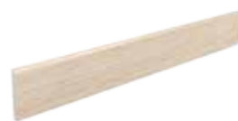
Battiscopa / LF 10 7,5x60 3"x24" 020

Pezzi Speciali Special Pieces • Formteile • Pièces spéciales