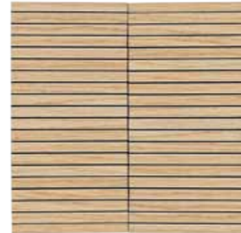
Mosaico / LF 1 30x30 12"x12" 228