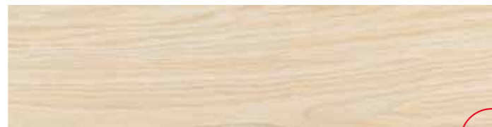
LG 10 Grip 15x60 6"x24" 079

In fase di posa si consiglia una sfalsatura massima di 15 cm Do not offset brick pattern by more than 15 cm Bei versetzter Verlegung wird ein Versatz von maximal 15 cm empfohlen En phase de pose on conseille un décalage de 15 cm au maximum