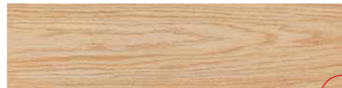
LG 1 Grip 15x60 6"x24" 079

In fase di posa si consiglia una sfalsatura massima di 15 cm Do not offset brick pattern by more than 15 cm Bei versetzter Verlegung wird ein Versatz von maximal 15 cm empfohlen En phase de pose on conseille un décalage de 15 cm au maximum