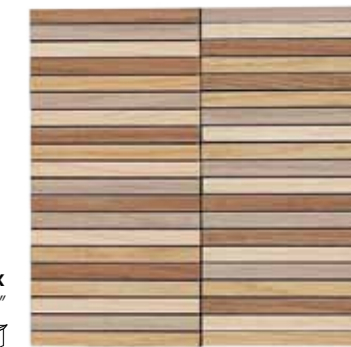
Factory Mix 30x30 12"x12" 228