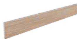
Battiscopa / LF 5 7,5x60 3"x24" 020

Pezzi Speciali Special Pieces • Formteile • Pièces spéciales