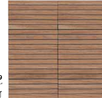
Mosaico / LF 9 30x30 12"x12" 228