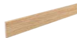
Battiscopa / LF 1 7,5x60 3"x24" 020

Pezzi Speciali Special Pieces • Formteile • Pièces spéciales