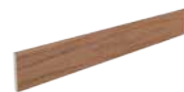
Battiscopa / LF 9 7,5x60 3"x24" 020

Pezzi Speciali Special Pieces • Formteile • Pièces spéciales